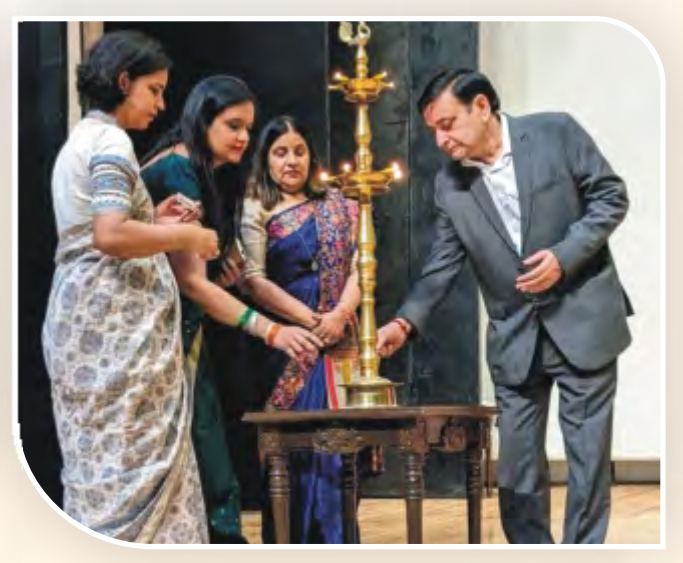
Shri Arun Gemini (Famous Hindi Poet)