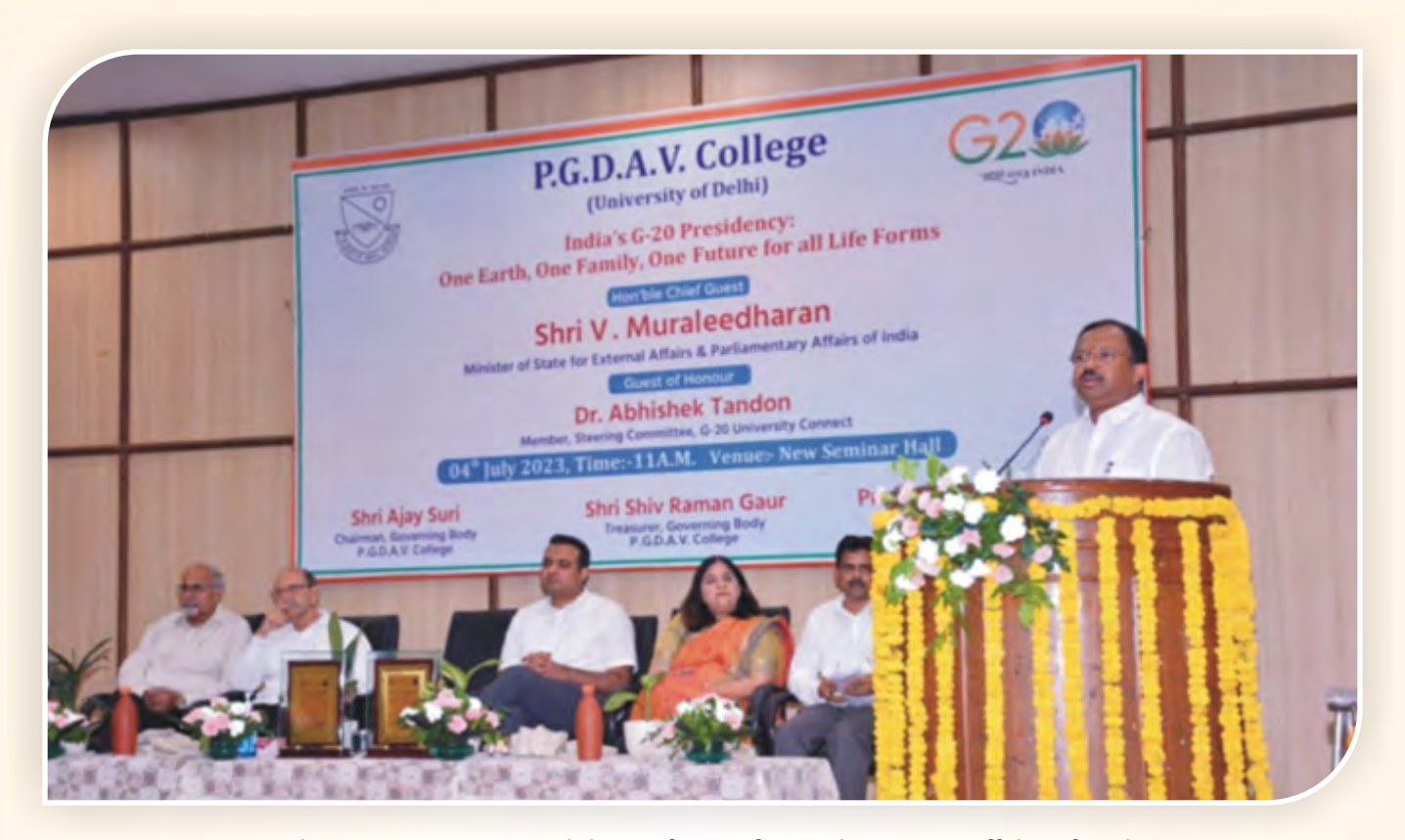
Shri V. Muraleedharan (Minister of State for Parliamentary Affairs of India)