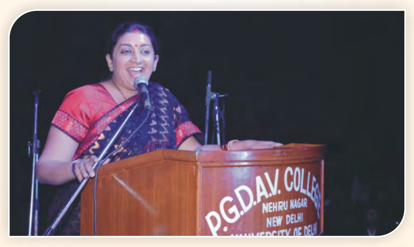
Smt. Smriti Irani (Union Minister Of India)